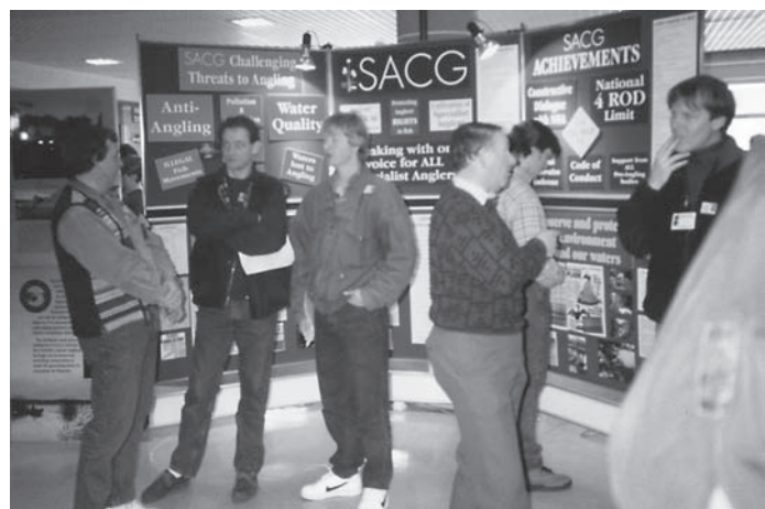
We had some disagreements with them!